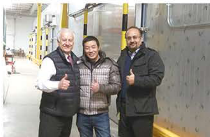
Comprehensive Cold Storage & Frozen Project in US

Guangzhou Haizhu District Center for Disease Control and Prevention is a special medical institution under the Haizhu District Government. CBFi provided 15 GMP pharmaceutical cold storage and professional maintenance training for the agency.