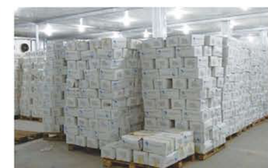
Mexico Integrated Fish Processing Cold Room

CBFi is a strategic partner of Leman Culture Entertainment Co., Ltd. We already built the Leman Ice Kingdom of Jiangmen Wanda Plaza in Guangdong and the Hantian Lefeng Ice and Snow World of Fujian Putian.