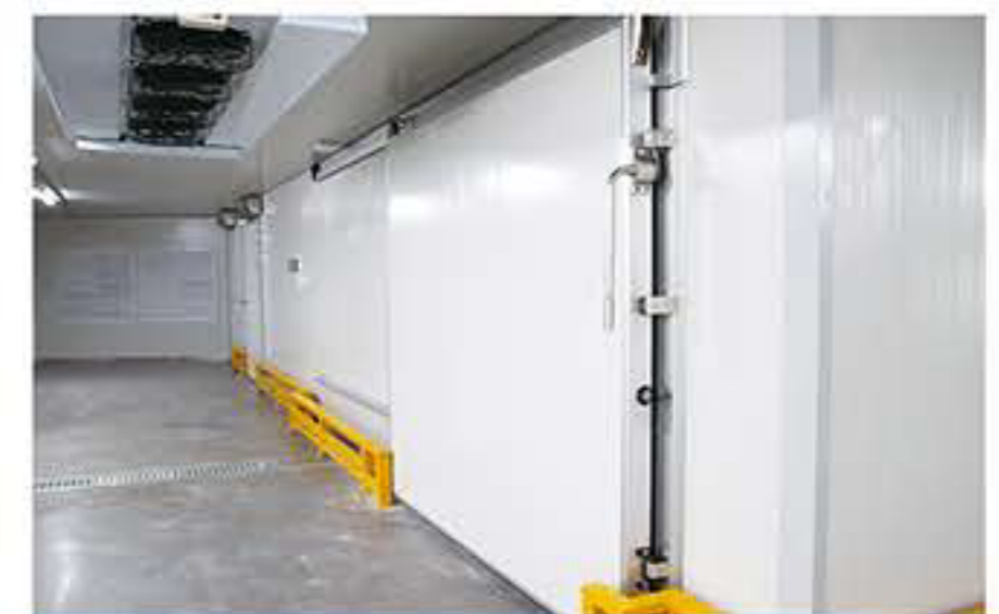
GMP Medical Cold Room in Haizhu District GZ

Auto Pellet Freezing Room Project for Heshi Aquatic, which is a leading fishery enterprise in Guangdong Province, is a 6,730 m 3 cold storage project for aquatic products. Automatic pellet system is used to fully use the space in the freezer.