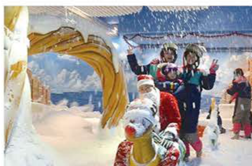
Amusement Cold Storage "Ice and Snow Kingdom" in Jiangmen China

International Golden Food is a famous food supplier for 5 stars hotels and supermarket. CBFi designed and installed a large cold freezer to store food such as red dates and cheese for the company.