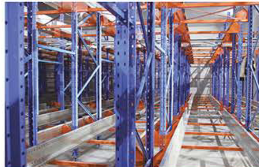
Auto Pellet Freezing Room Project for Heshi Aquatic

Qiandama and CBFi have formed a multidimensional cooperative relationship, three LCCP (Low temperature, Clean, Comfortable, Plant) aquatic product processing and distribution centers in Shenzhen, Dongguan and Guangzhou have been built.